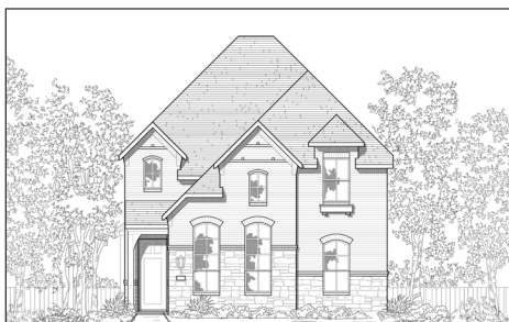
3909 Stars Street Available October 2024 4 Bed | 3 Bath | 2 Story $720,305 | 2,579 Sq. Ft.