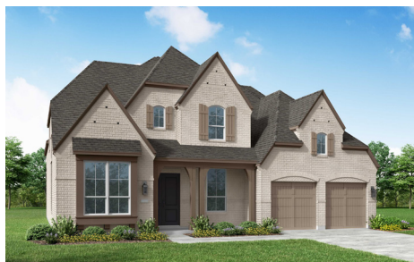
4804 Cordwood Drive Available October 2024 5 Bed | 5.5 Bath | 2 Story $1,046,243 | 3,983 Sq. Ft.