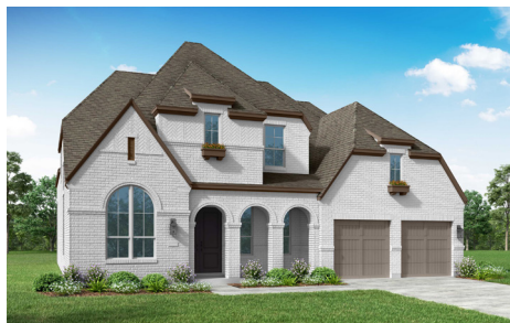
4806 Strada Street Available October 2024 5 Bed | 5.5 Bath | 2 Story $1,045,993 | 4,098 Sq. Ft.