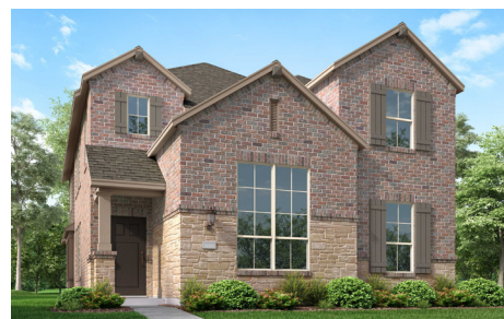
3916 Composition Drive Available October 2024 5 Bed | 3 Bath | 2 Story $706,901 | 2,513 Sq. Ft.