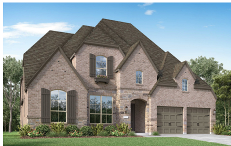
4800 Cordwood Drive Available September 2024 5 Bed | 5.5 Bath | 2 Story $1,071,915 | 3,983 Sq. Ft.