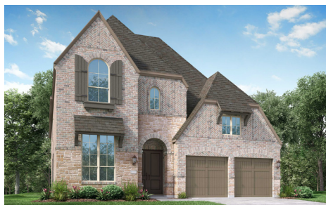
3913 Linear Drive Available September 2024 4 Bed | 4.5 Bath | 2 Story Call for Pricing | 3,509 Sq. Ft.