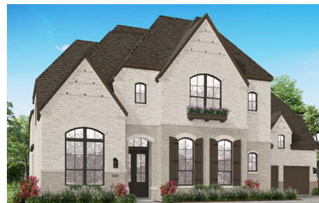
4216 Sunrise Lane Available October 2024 5 Bed | 5.5 Bath | 2 Story $1,358,125 | 4,534 Sq. Ft.