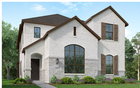
3804 Stars Street Available October 2024 4 Bed | 2.5 Bath | 2 Story $709,591 | 2,513 Sq. Ft.